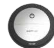
HOST remote Start Stop with optional Warm Up

If you prefer you can pick individual items see tritonshowers.co.uk