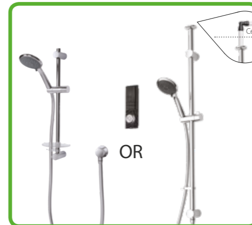
Wall Fed Ceiling Fed Alternative riser rails included