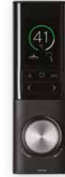
HOST Black Digital Shower