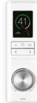
HOST White Digital Shower