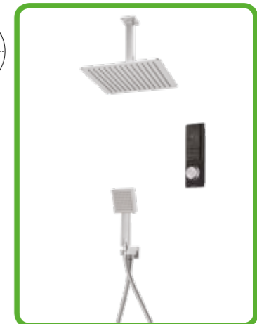
Wall Fed and Ceiling Fed