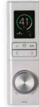
HOST Cloud Grey Digital Shower