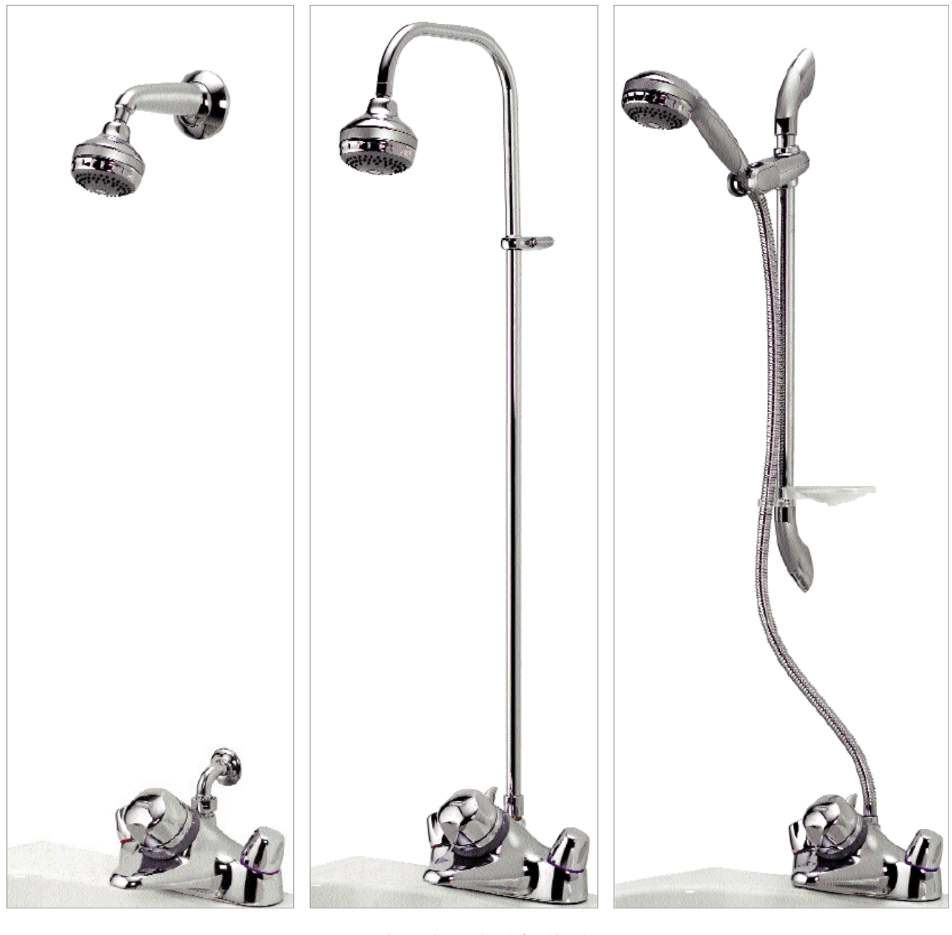
Aquamixa Thermo (300.01) with fixed head concealed (99.50.01) and built in fixed head conversion kit (308001).